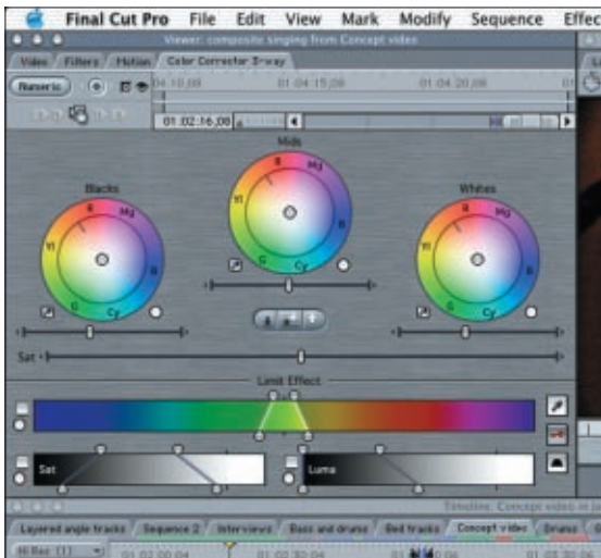
A terrific new feature in Final Cut Pro 3 is the ability to perform real-time three-way COLOR CORRECTION to DV source footage.

“IF YOU CAN SEE IT, YOU CAN SHOOT IT. DON’T WORRY, WE’LL FIX IT IN THE EDIT SUITE.”