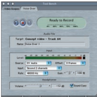
The RECORD-TO-TIMELINE feature allows you to overdub audio as the movie plays.

the benefit of a narration audio track to guide the editing process. Final Cut Pro 3 is now capable of recording audio in sync directly into the time line. Editors can record their own narrations locked to the picture to see exactly how the clips match up. And if you have a soundproof room where you can isolate extraneous sounds, you can even use Final Cut Pro to record your final narration.