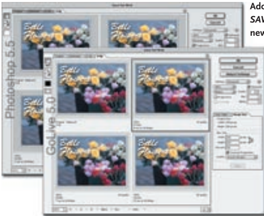
Adobe has added Photoshop's SAVE FOR WEB feature to the new version of GoLive.