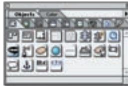
GoLive 5 now includes support for an expanded list of W3C FILE FORMATS , including SVG, Flash, Apple QuickTime Streaming and RealNetworks G2.

and optimize images directly within GoLive. No more switching between applications for simple tasks like resizing images. GoLive always links to the corresponding source files when more advanced edits are required, streamlining your workflow with the convenience of knowing that the original source files and applications are always just a single click away. If a change is made to the PSD file within Photoshop — such as deactivating a layer — and it is saved, GoLive will automatically update the image within the layout window.