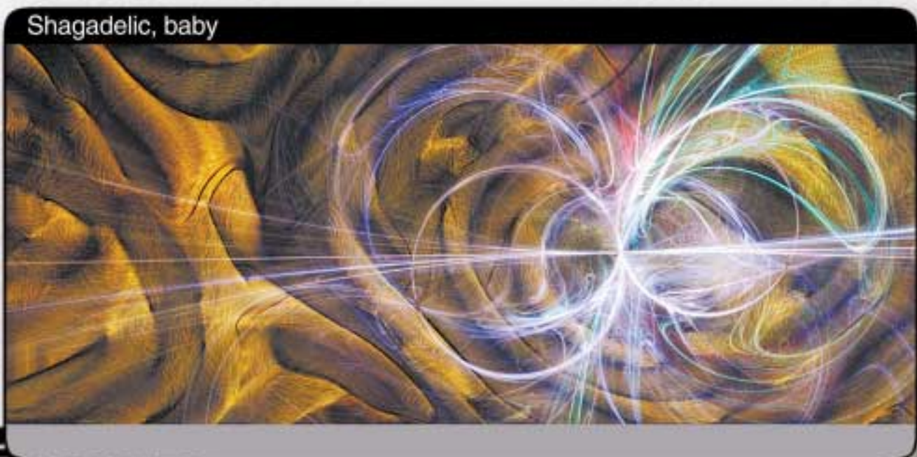
(right) "FiberOptix" is eerie. You actually watch hairs grow before your very eyes. "Frax Flame" it and you've got the makings of a post card from the astral plane.