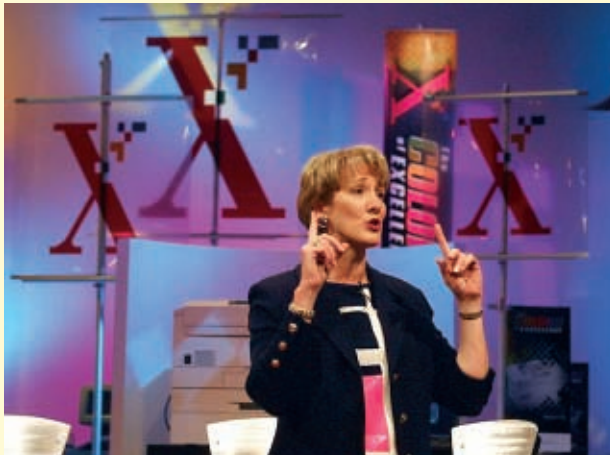
Xerox Chief Operating Officer Anne Mulcahy emphasizes a point at the company's New York press conference held in March.

A key part of the Xerox plan is the development of next generation color technologies code named FutureColor, which will drive new high volume digital color presses that are expected to be rolled out in 2002. Xerox says that FutureColor will allow operating costs on the DocuColor 2000 series to be cut in half, yet produce better color consistency and repeatability, and expand support to a wider range of media.