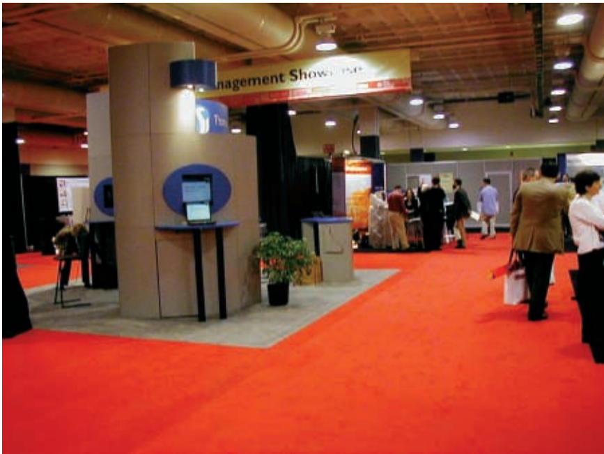
Hey! Where did everybody go? As the show wound down, this was the scene in the E-Content area of the floor. Trouble is, it wasn't much busier than this even at "peak" hours.