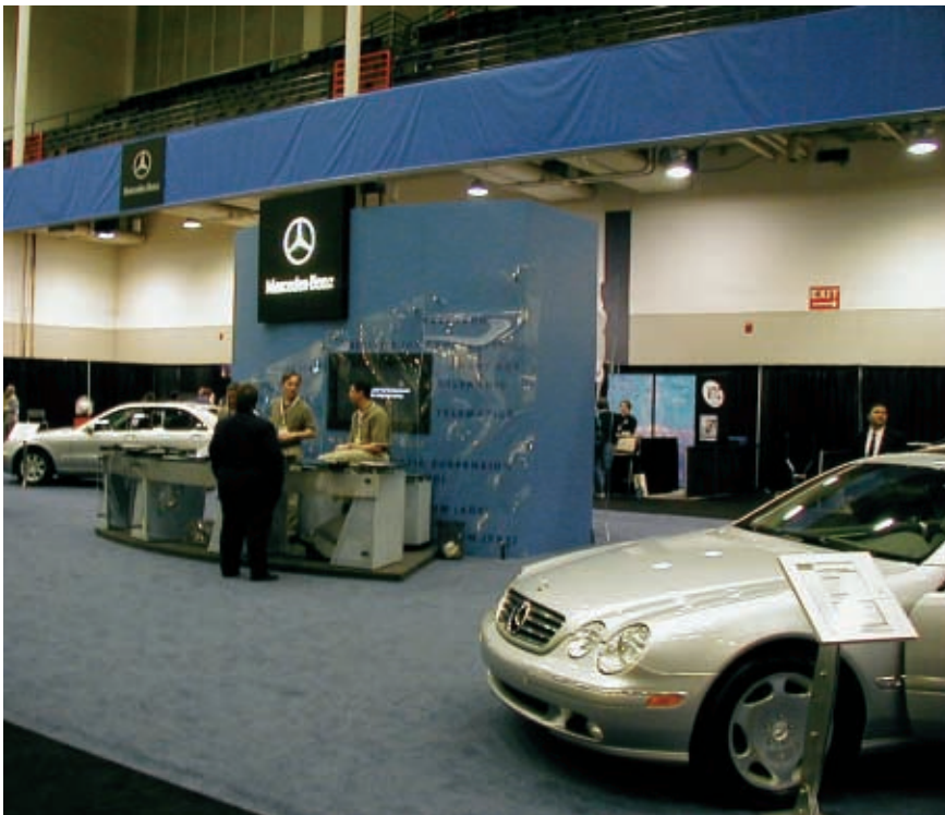
What was Mercedes doing at a show for publishers and e-content creators? Maybe they hadn't heard that the dot.com boom was over. But the cars sure looked pretty.

SAME (Stunion Appearance Matching Environment) technology (watch for a full review in our next issue). While we're on the subject, I'm also awaiting the upcoming