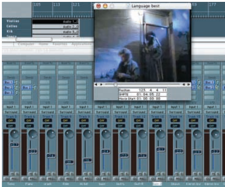
QuickTime movies can be imported into Logic Audio's software, allowing for frame-accurate music synchronization.