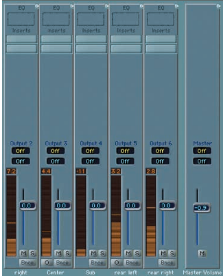
You can also route your tracks in surround sound format to individual outputs. Here six channels are used for 5.1 surround sound.

Once the sound levels are mixed to your liking and placed in the right surround space, you then export six separate tracks: left, center, right, left surround, right surround and sub woofer. These six tracks are then imported into Apple's A-Pack, which converts them into one 5.1 AC3 Dolby Digital track. That track is then imported into a DVD authoring system, such as Apple's new and much-improved DVD Studio Pro 2.