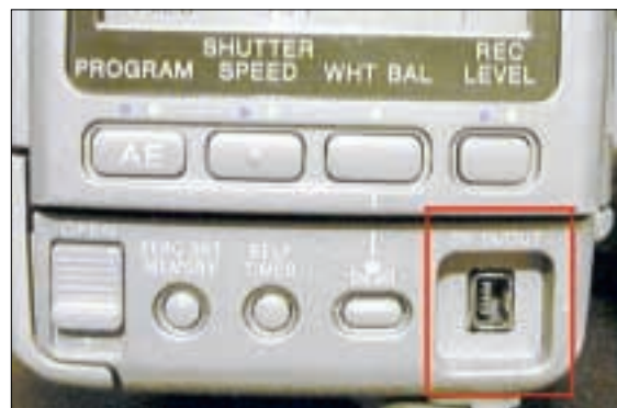
To make the FIREWIRE CONNECTION between your DV camera and its internal tape drive, look for the jack on the back of your camera (Sony calls it iLink).

To capture footage for editing via FireWire using iMovie 2 , you need to have either a DV camera/recorder or a DV transcoder box. This DV codec has been a little confusing for the newcomer to desktop video. The iMovie TV ads show how simple it is to edit your home movies, but they don't mention that DV video is required. Many customers think that you can plug your 8mm or Hi-8 video camera into the computer and start editing. That