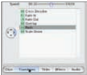
Use the TRANSITIONS DIALOG box to create wipes, dissolves and other effects.