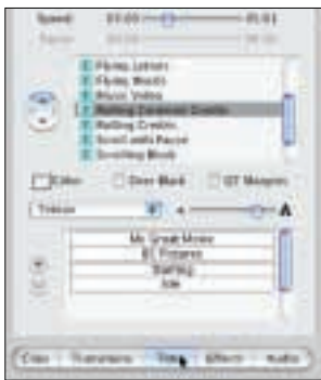
To add titles, iMovie has a TITLES DIALOG in which you may select pre-generated scrolling text or type on titles.