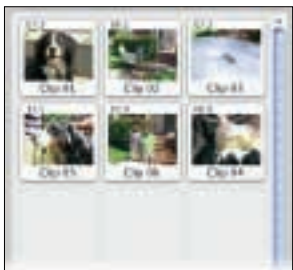
Captured DV footage is stored in iMOVIE'S "SHELF". Clicking on a thumbnail loads it into a "clip viewer".

Y-C, also known as SuperVHS and line inputs/outputs, are transcoded to and from DV. I suggest that even if you have a DV camera, you should purchase one of these DV transcoders and leave it hooked up to the FireWire port on the Mac—it's the best way to see how your work in progress is coming along. The DV playback on a computer monitor can sometimes be a little choppy, whereas the playback on a TV set, via the DV transcoder, is crystal clear without any dropping of frames.