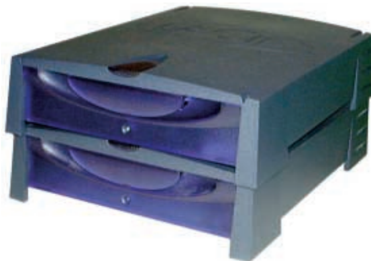
Digital video requires lots of storage. LaCie now sells a stackable fast 75GB FIREWIRE EXTERNAL DRIVE (above) for about $1600 (Cdn).

The FireWire (or iLink) jack at the back of the DV camera is attached to the camera's internal tape drive. Digital video files that are stored on tape are simply transferred to your computer via