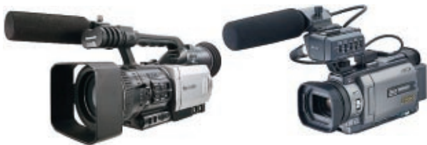
In the DIGITAL continuum: the Panasonic AG-DVX100 24P DV Cinema Camera and the web capable Sony DSR-PDX10

Last year, director David Lynch ( Twin Peaks , Blue Velvet , Mulholland Drive ) shot a Sony PlayStation2 commercial ( www.PixelMonger.com/screeningroom.html ) with a PD150. Interestingly, the commercial has a filmic look, something that's commonly associated with the XL1s. (Check out