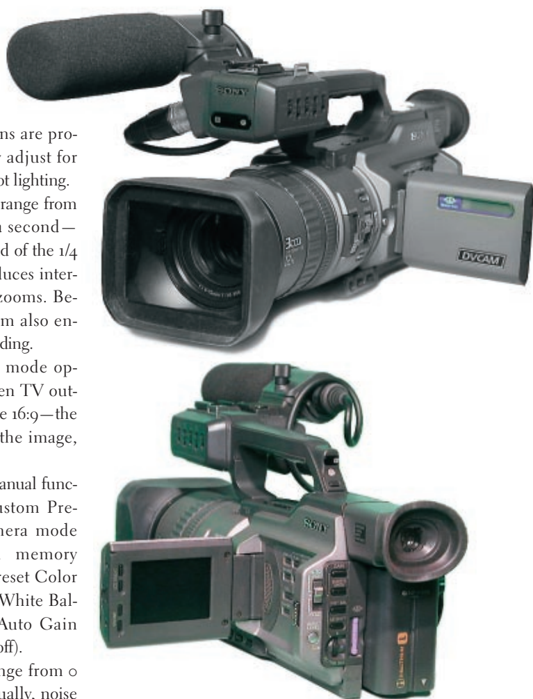
The SONY DSR-PD150 is sometimes called “the bible for DV shooters.” Its low light performance is extraordinary. The PD150 has a reputation for durability, plus it's small, lightweight and has a flip-out LCD screen, making it very versatile.

Progressive scan on the PD150 is 15fps, so it's mainly for capturing stills to a mem-