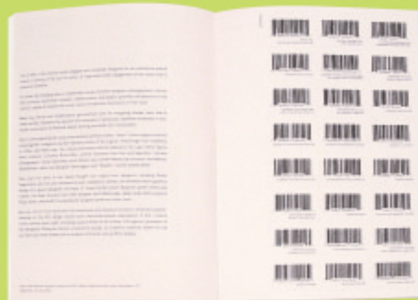
No-designism: a spread from the promotion booklet for this year's AIGA conference, designed by Oh Boy. The theme of the conference is the responsibility of the design community for the excesses of consumer culture.

The political negativity prevalent in the fine art world for the past 30 years is seeping into commercial design. It's happened in the UK and the US, and will happen here. RGD Ontario is in the thick of it. This isn't about the contretemps between those who view graphic design as a profession and those who consider it an artistic free-for-all. It's about No Logo and First Things