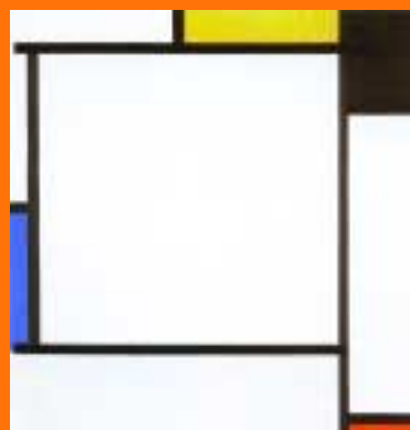
Piet Mondrian Composition 2, 1922 Oil on canvas