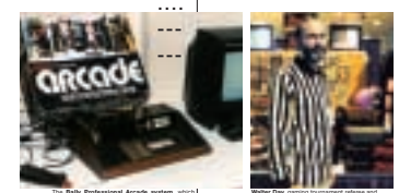
The Daily Professional Arcade system, which debuted in 1978 and boasted a playing clock speed of 120 Hz. Despite the high speed game play and goal play, the cabinet failed to meet projected sales targets. It disappeared until the early 1980s, when a group of fans bought the rights from Daily and relabeled it under the name AtariPac .