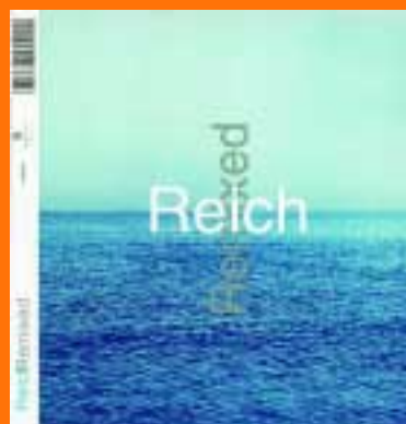
Reich Remixed CD sleeve, 1999

The moral dimension of the International Style (introduced into Canada around 1960) made it the standard, in a heraldic sense, of the professional establishment.