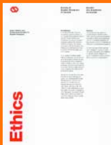
Member literature, Society of Graphic Designers of Canada, 1995

De Stijl’s rectilinear abstraction strongly influenced the pioneer graphic designers of the 1920s.